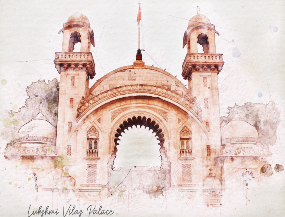
Lukshmi Vilas Palace

The city is situated along the banks of the Vishwamitri River and serves as an important cultural, educational, and industrial hub in the region. The city's landscape is dotted with parks, gardens, and historic monuments, highlighting its rich heritage.