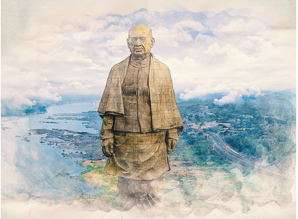
Statue of Unity

Overall, Vadodara presents itself as a multifaceted city that embraces its past while embracing the present opportunities, making it a captivating destination for those seeking a balance of history, culture, and contemporary living.